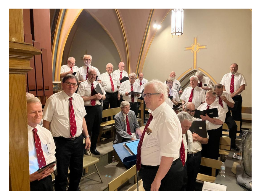
The Saint Joseph Liederkranz German men's choir