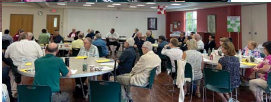
Meeting of Associates with SSS Religious