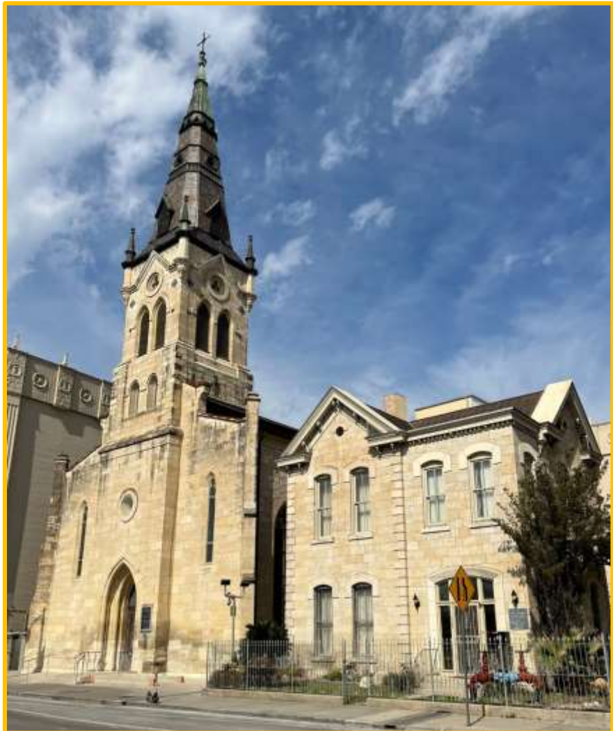
Saint Joseph Downtown Church in San Antonio, Texas