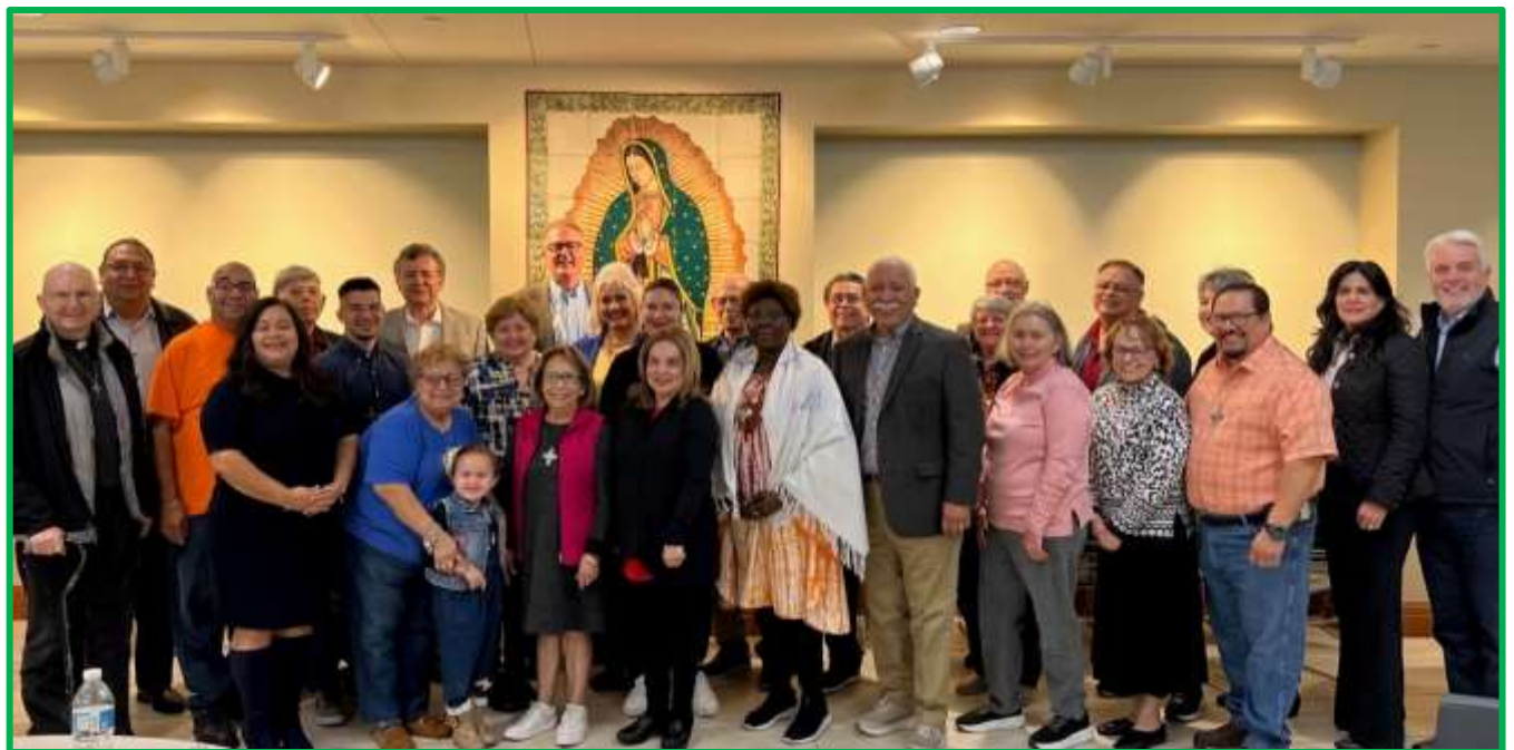
Associates in San Antonio, Texas

After an SSS Community Dinner Meeting, I met with 32 of the Associates of San