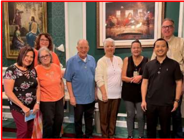
Pastoral Staff of Saint Vincent de Paul Parish in Holiday, Florida